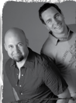
Skit Guys Evening Speaker