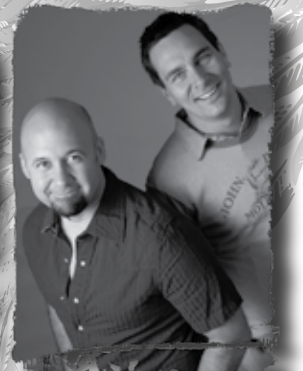
Skit Guys Evening Speaker