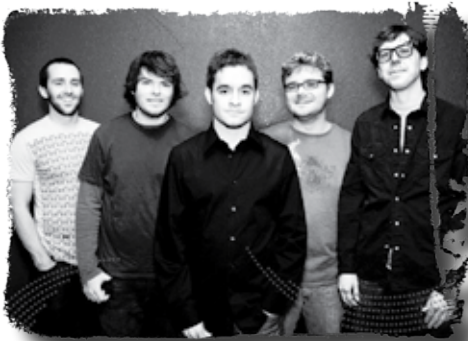
Dutton Band Worship Leader