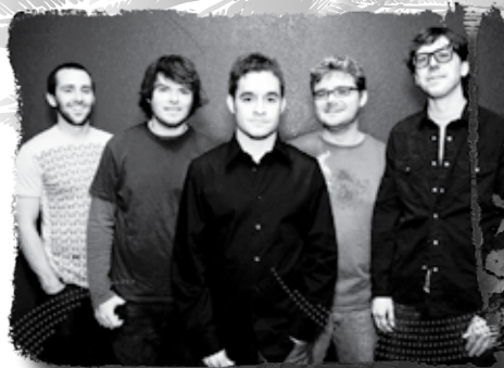
Dutton Band Worship Leader